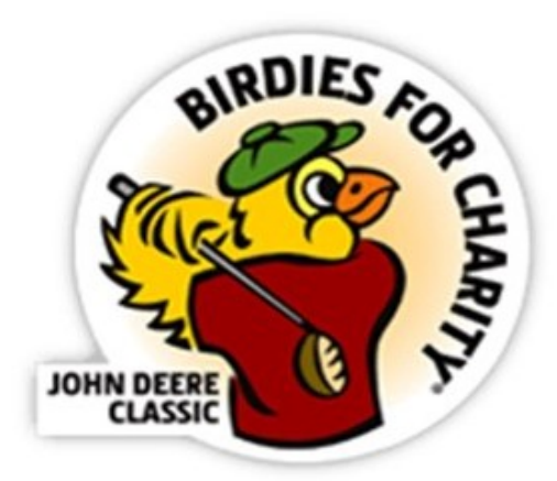
You can support Churches United by donating to Birdies for Charity.

Click on the link on the page and enter passcode: 061^cxLh